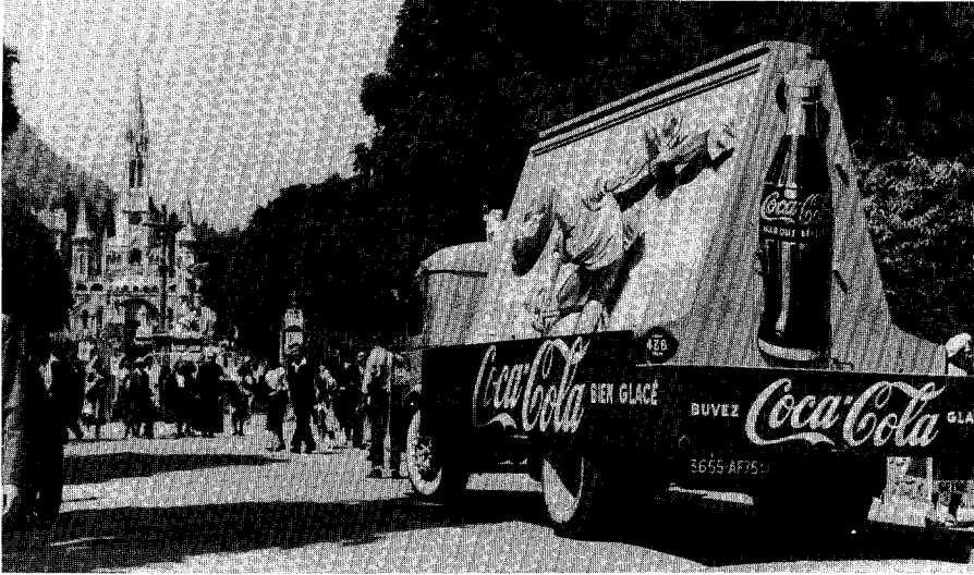
COCA-COLA JOINS THE TOUR DE FRANCE, LOURDES, 1951.

States—thus the reference to “a political question.” Like so much about the arrival of Coca-Cola in France the parliamentary debate was not what it seemed to be. What was said was often disingenuous and seldom disinterested. What was at stake was both real and symbolic.