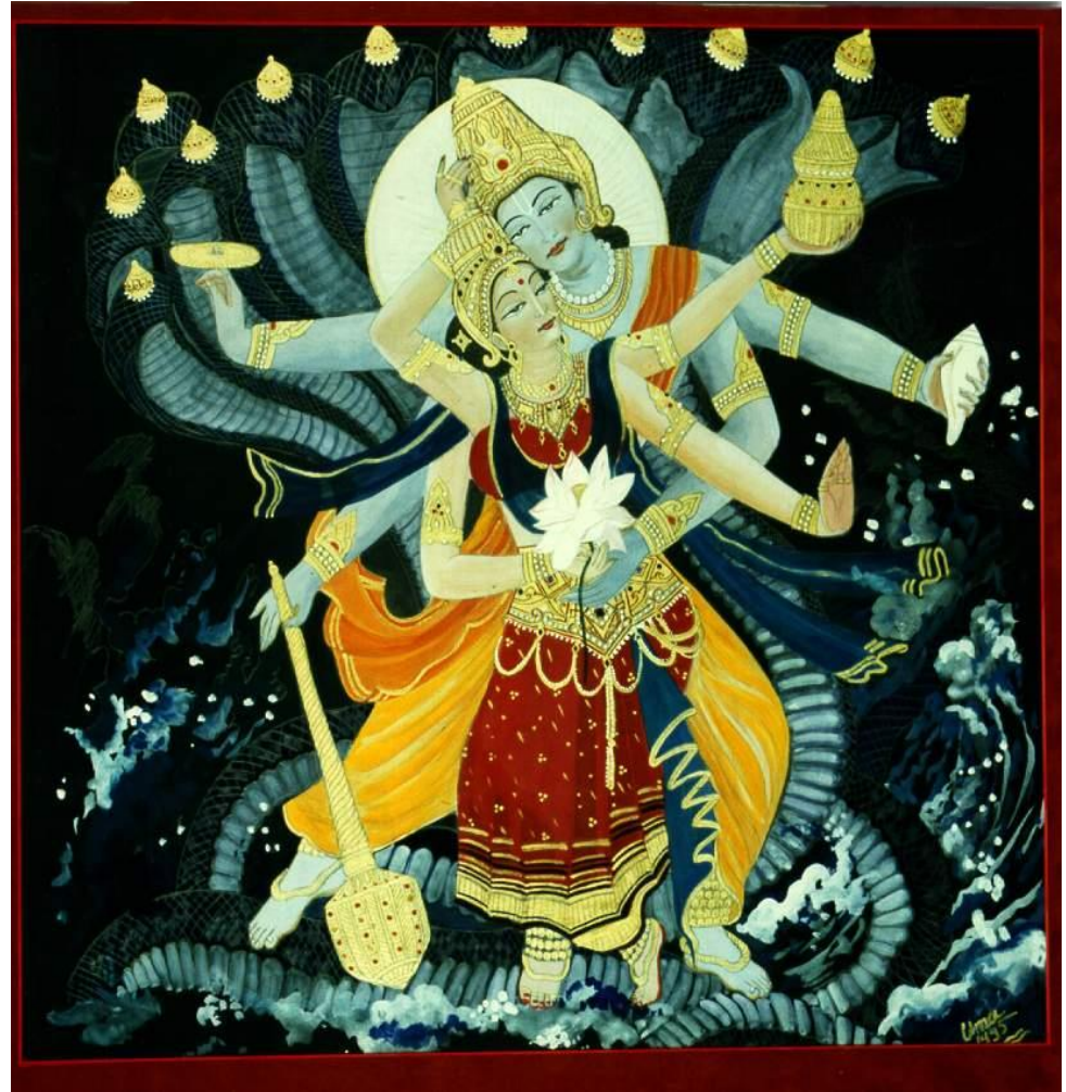
VISHNU-EXTRA ARMS EQUAL STRENGTH